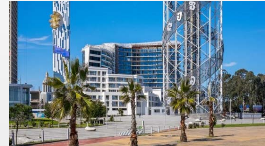
VIP Lounges & Retail Lease Revenue Opportunities