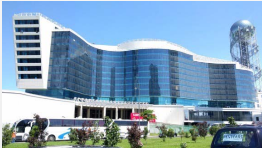
Grand Hotel and Casino 232 rooms = $33M Revenue

Meaningful investment ultimately funded through profitable hotel and casino revenues.