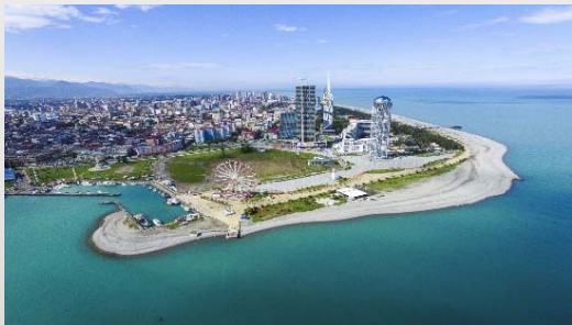
Batumi – Perl of Black Sea