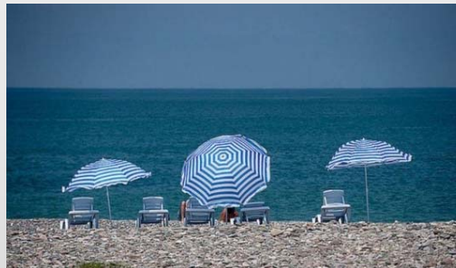
Access to the private beach Leased for 49 years