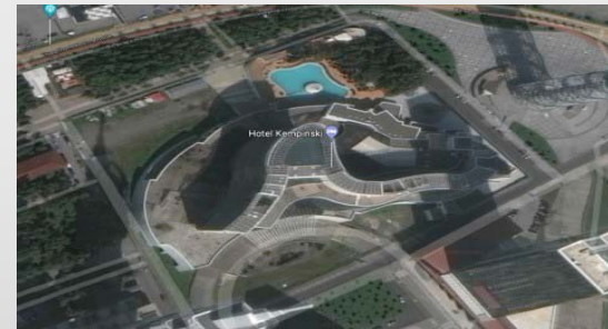
4 year construction completed