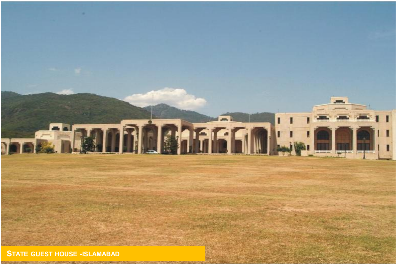
STATE GUEST HOUSE -ISLAMABAD