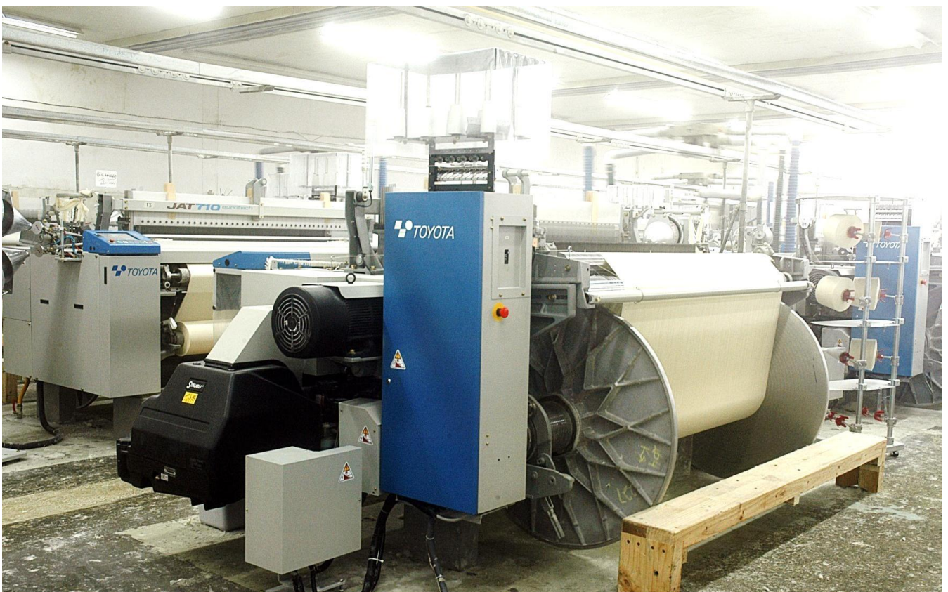
REDCO WEAVING & SPINNING MILLS