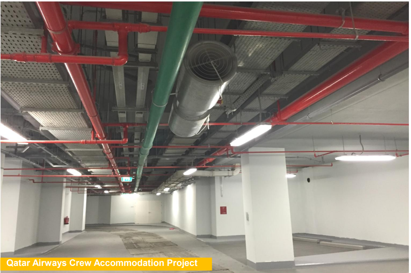
Qatar Airways Crew Accommodation Project