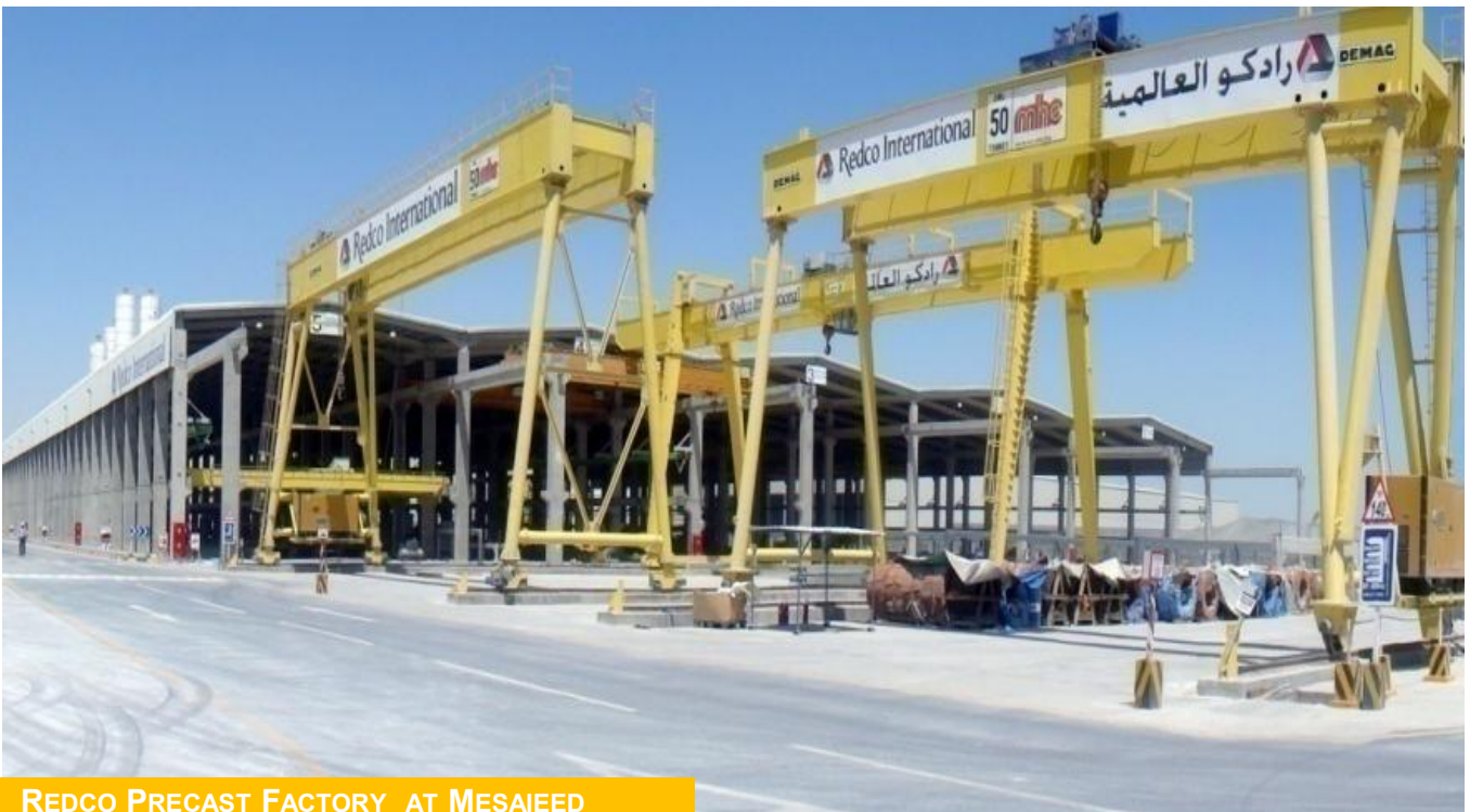
REDCO PRECAST FACTORY AT MESAIEED