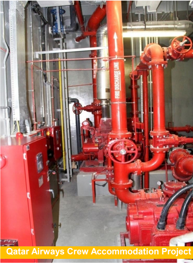
Qatar Airways Crew Accommodation Project