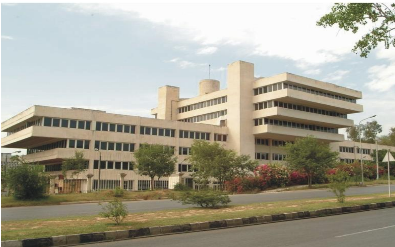
HEAD OFFICE BUILDING OF WAPDA - ISLAMABAD