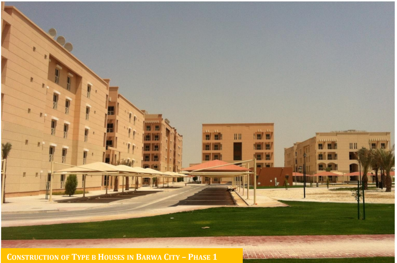
CONSTRUCTION OF TYPE B HOUSES IN BARWA CITY – PHASE 1