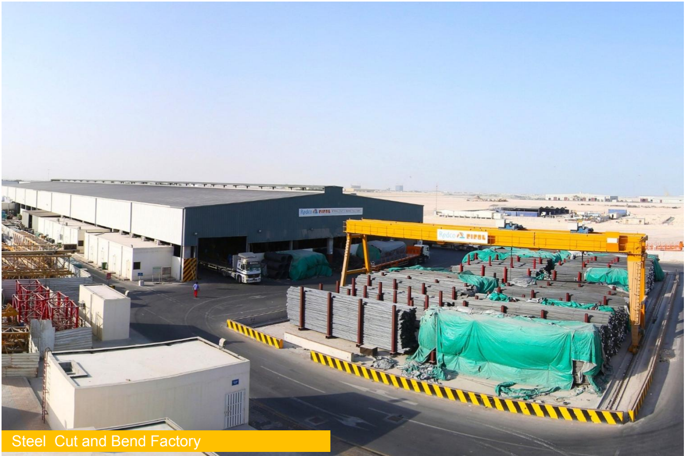
Steel Cut and Bend Factory