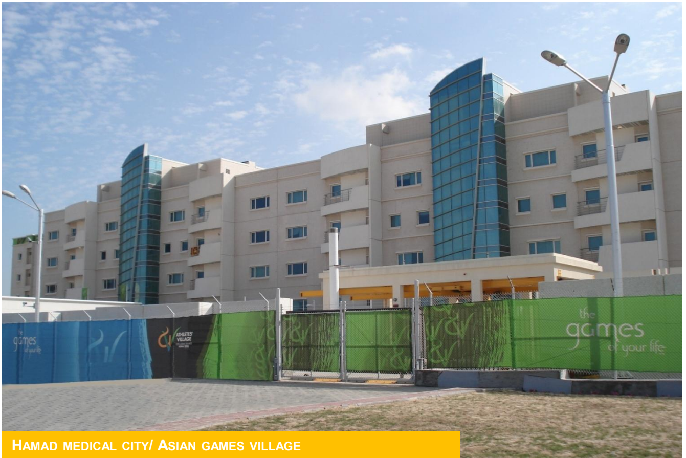
HAMAD MEDICAL CITY/ ASIAN GAMES VILLAGE