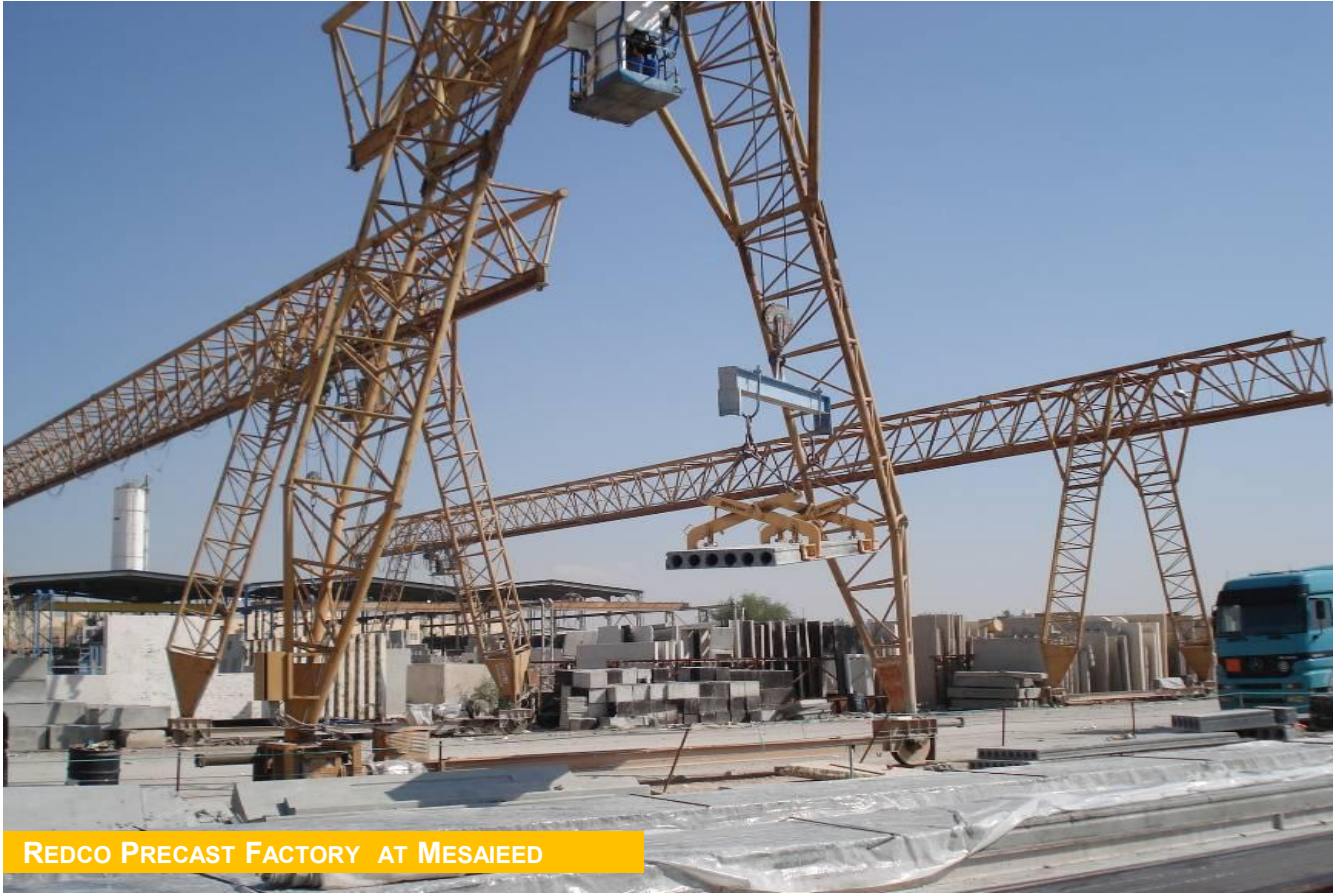
REDCO PRECAST FACTORY AT MESAIEED