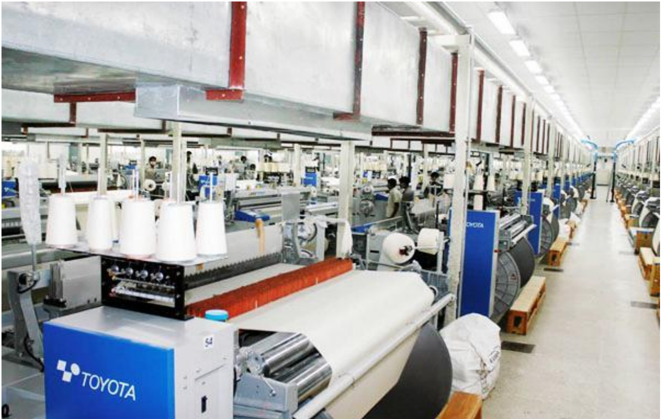
REDCO WEAVING & SPINNING MILLS