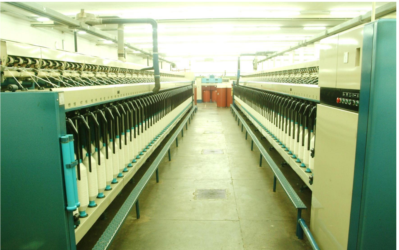
REDCO WEAVING & SPINNING MILLS