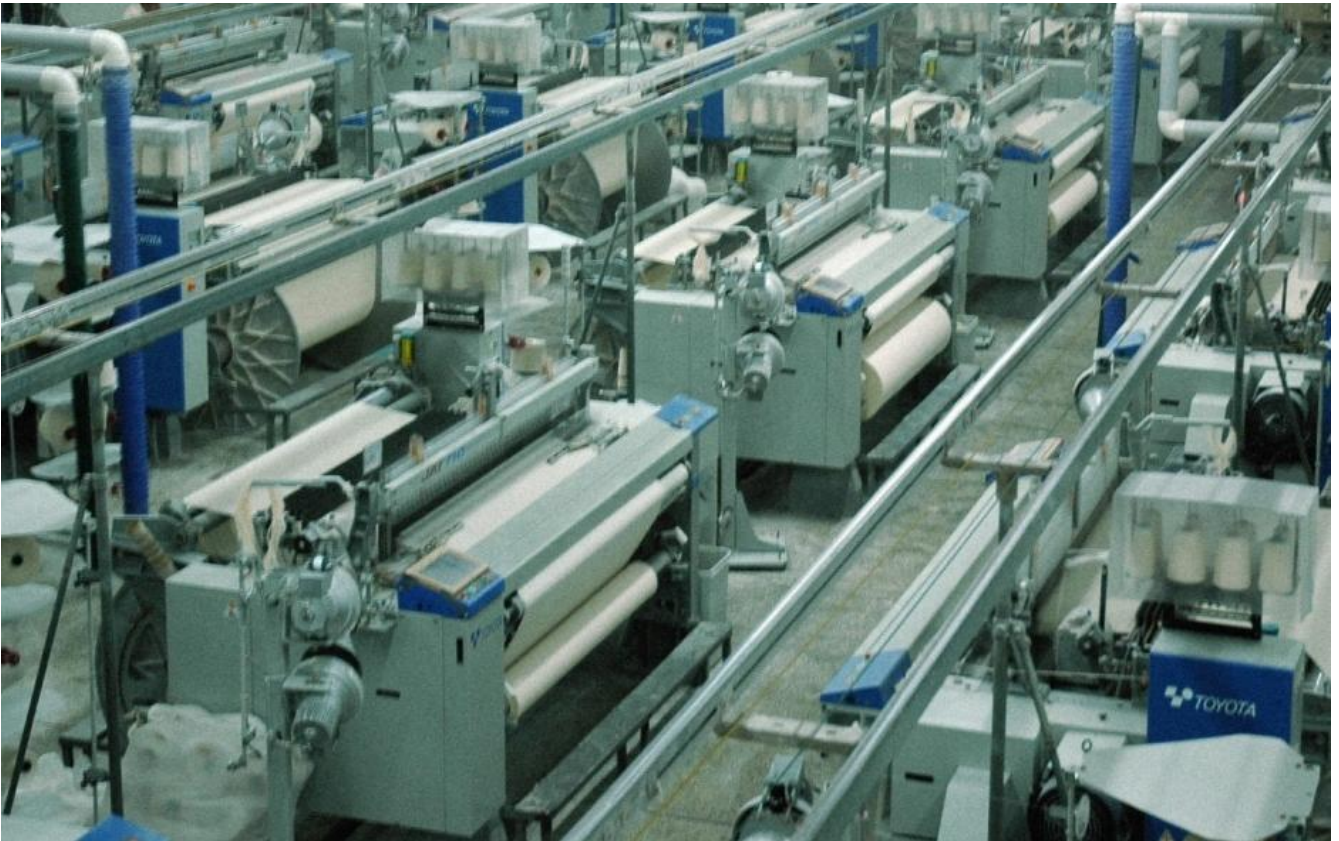
REDCO WEAVING & SPINNING MILLS