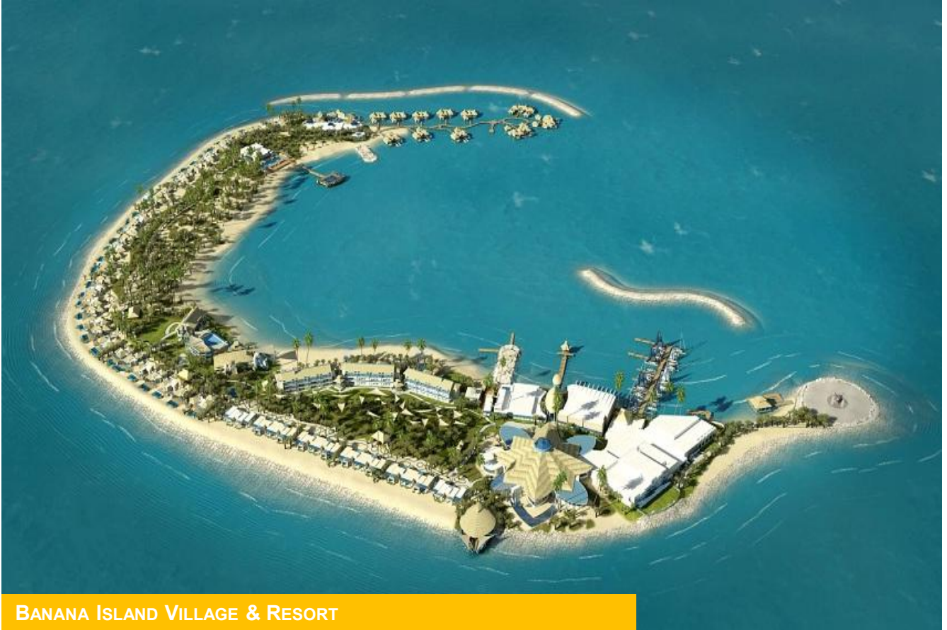
BANANA ISLAND VILLAGE & RESORT