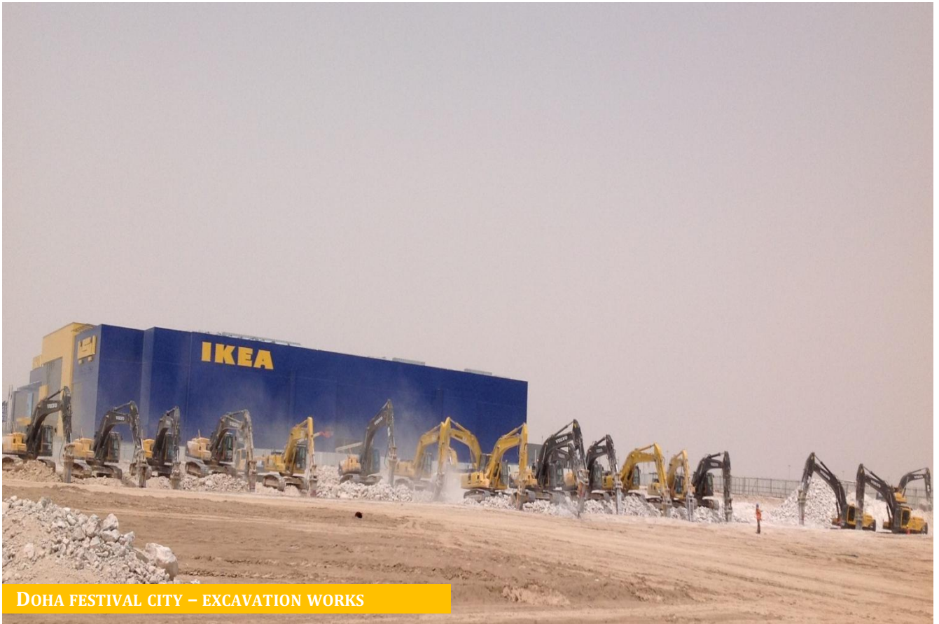
DOHA FESTIVAL CITY – EXCAVATION WORKS