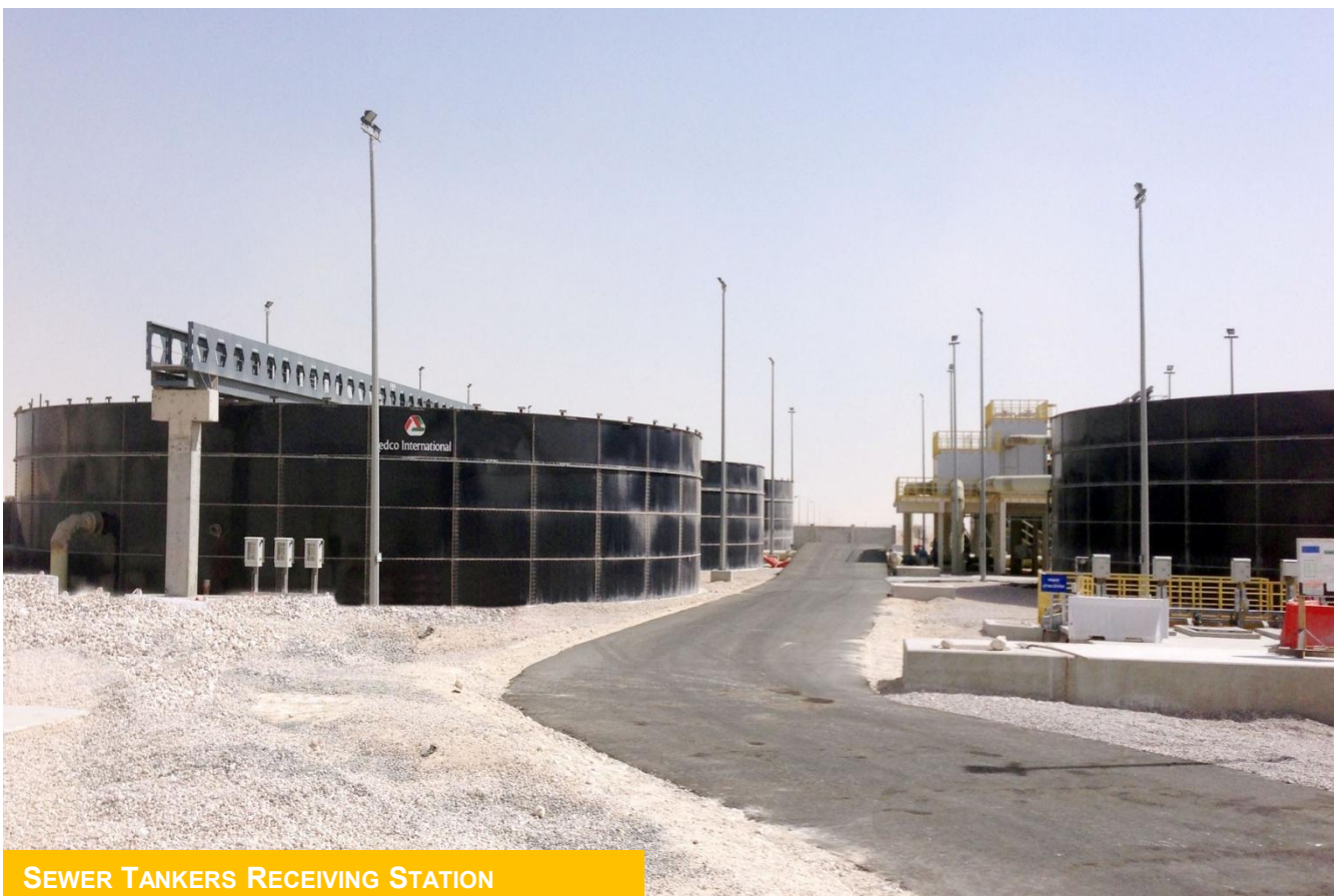
SEWER TANKERS RECEIVING STATION