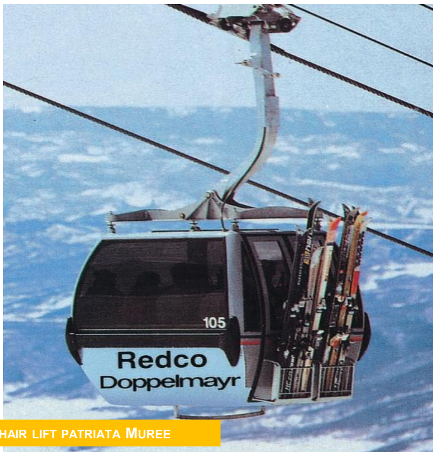
CABLE CAR & CHAIR LIFT PATRIATA MUREE