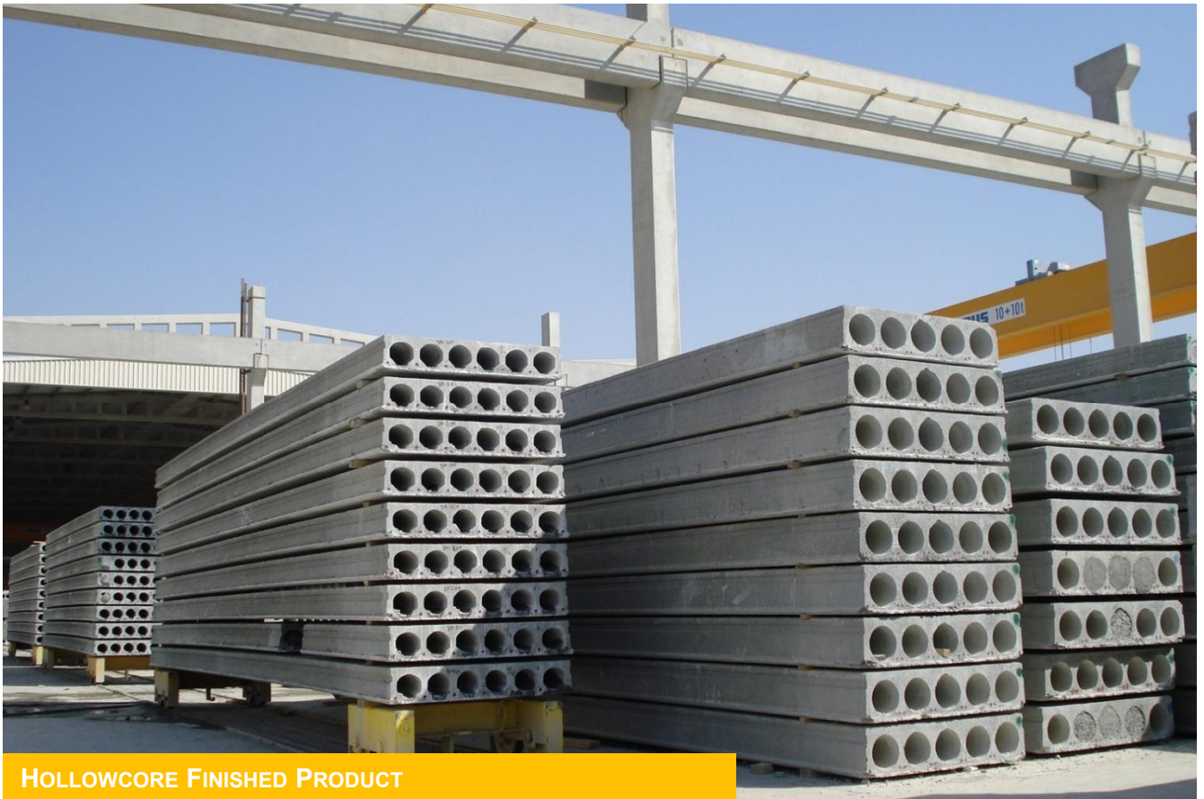
HOLLOWCORE FINISHED PRODUCT