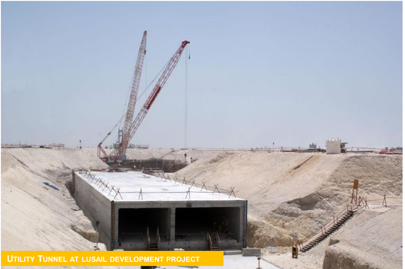
UTILITY TUNNEL AT LUSAIL DEVELOPMENT PROJECT