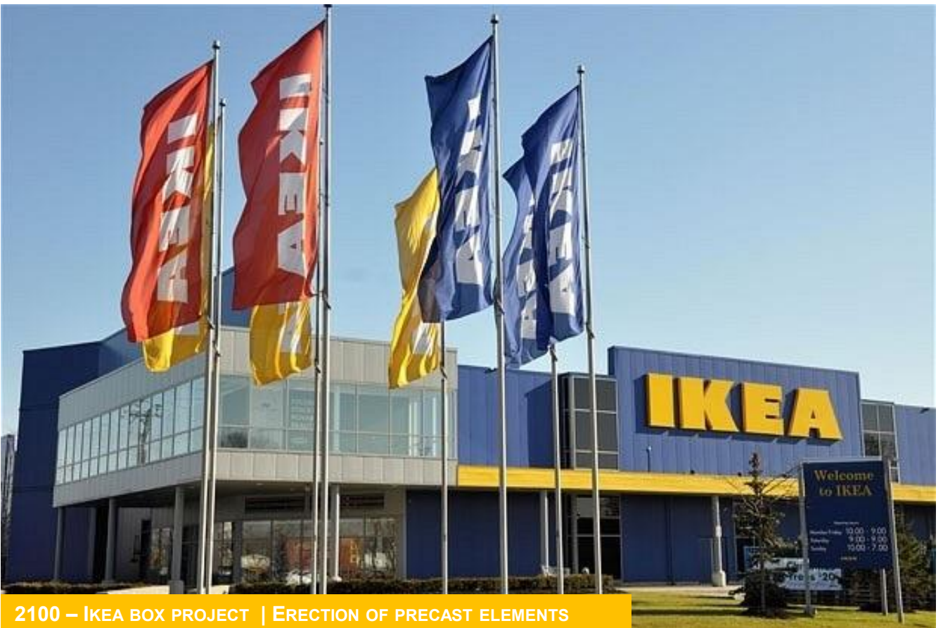
2100 - IKEA BOX PROJECT | ERECTION OF PRECAST ELEMENTS