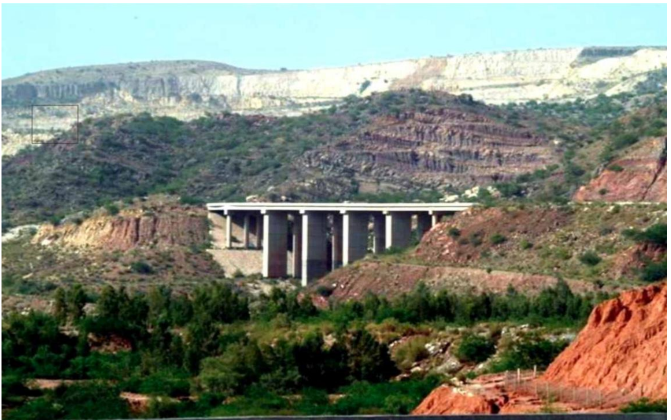
POST TENSIONED BRIDGE – MOTOR WAY PAKISTAN