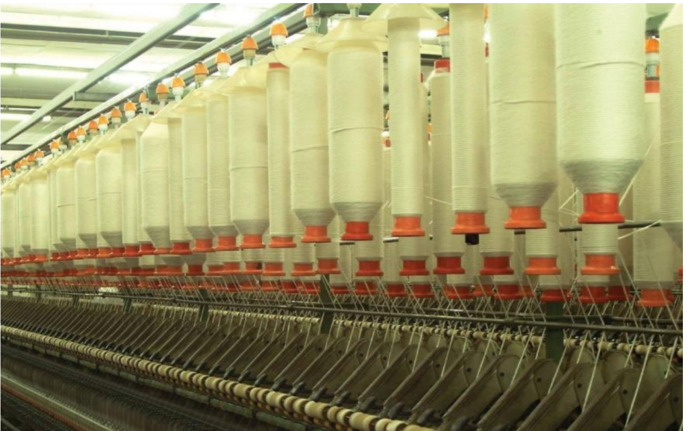
REDCO WEAVING & SPINNING MILLS