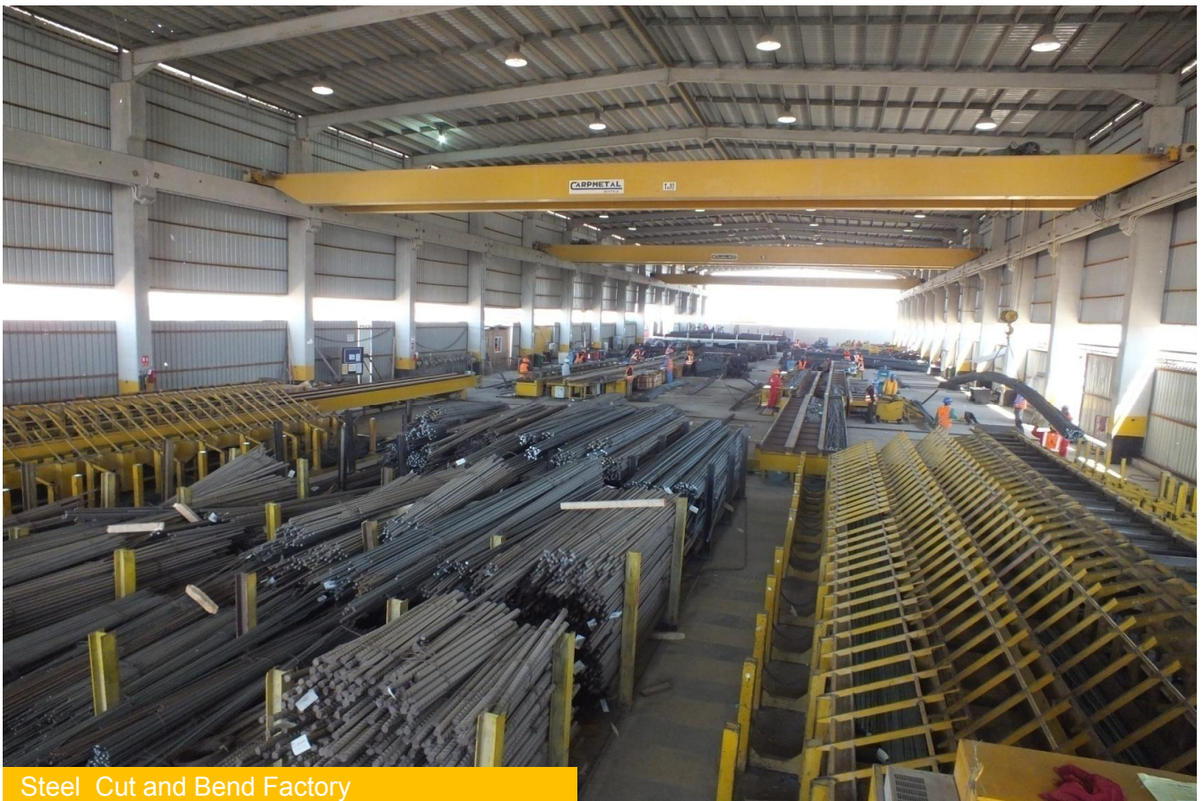
Steel Cut and Bend Factory