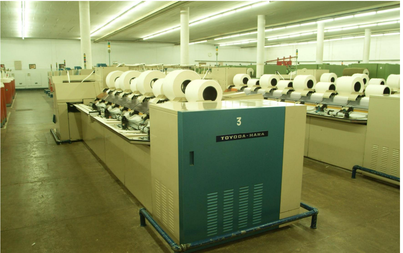
REDCO WEAVING & SPINNING MILLS