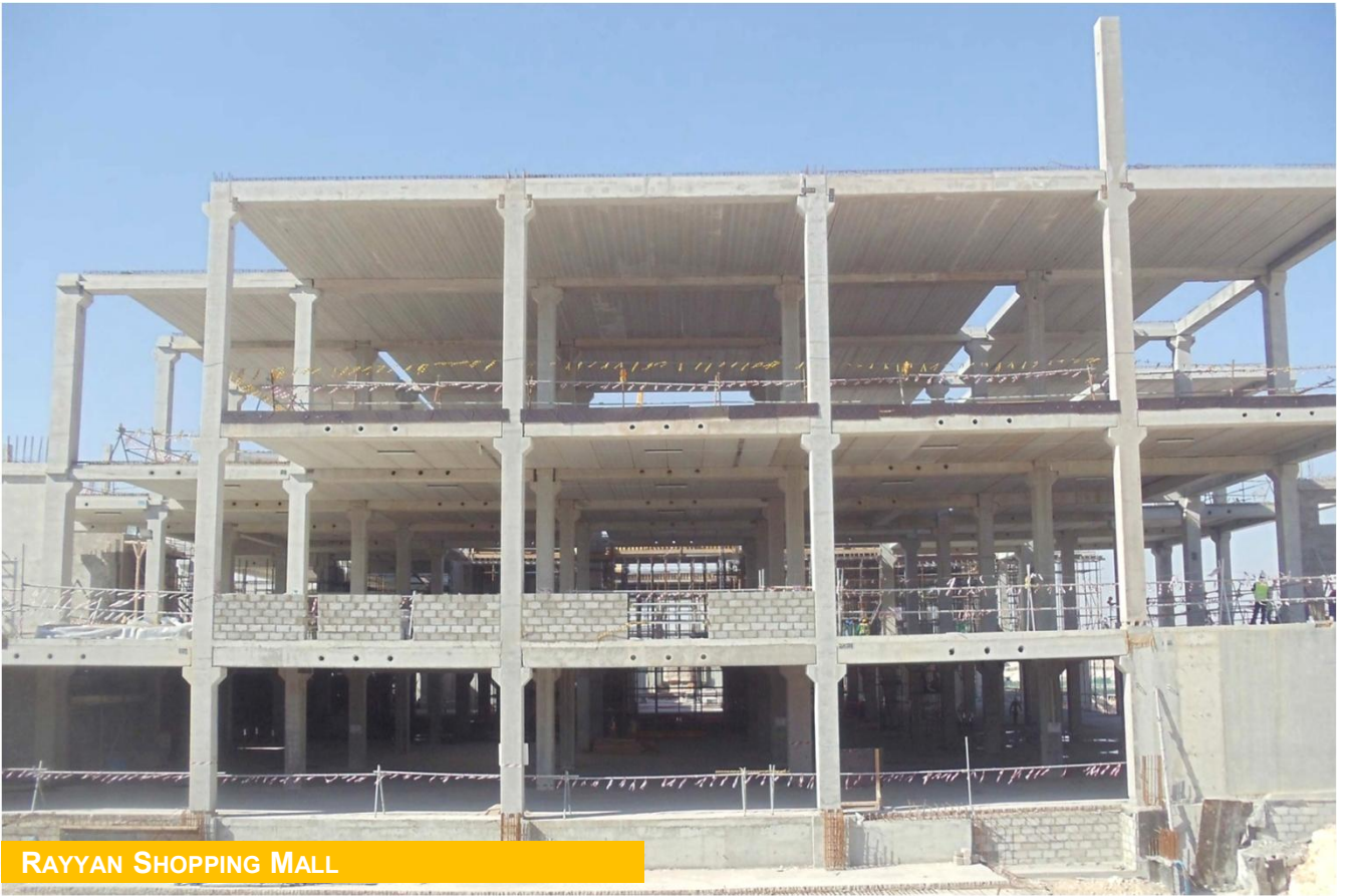
RAYYAN SHOPPING MALL