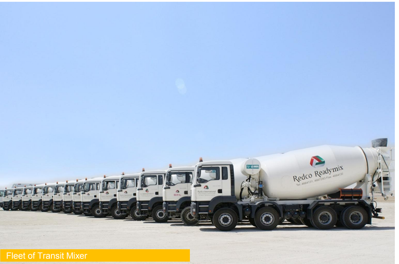
Fleet of Transit Mixer