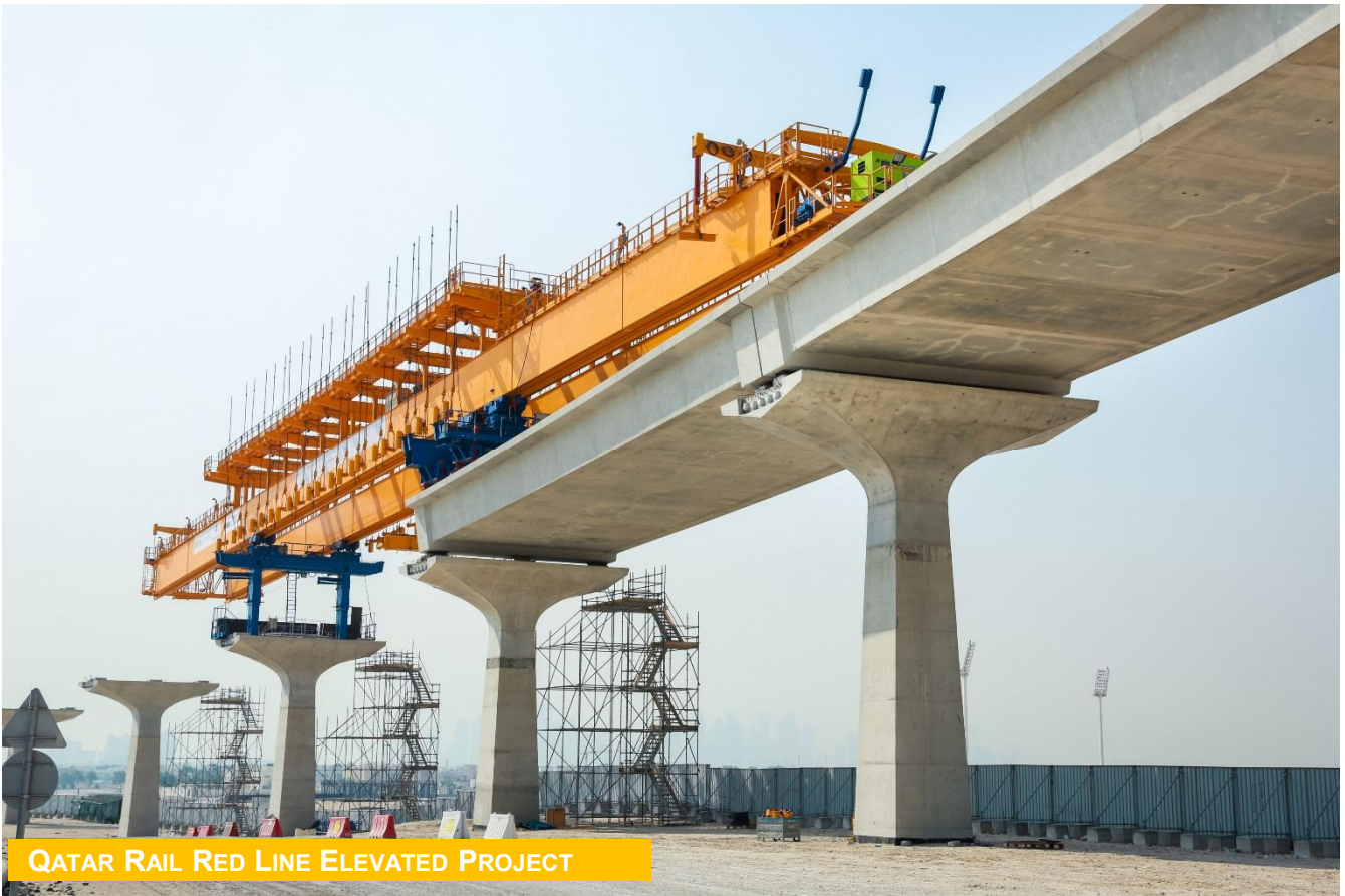
QATAR RAIL RED LINE ELEVATED PROJECT