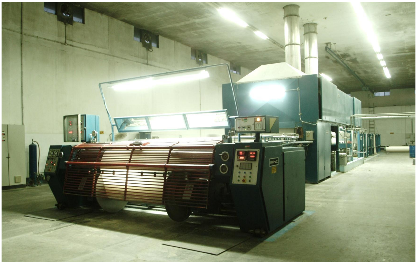
REDCO WEAVING & SPINNING MILLS