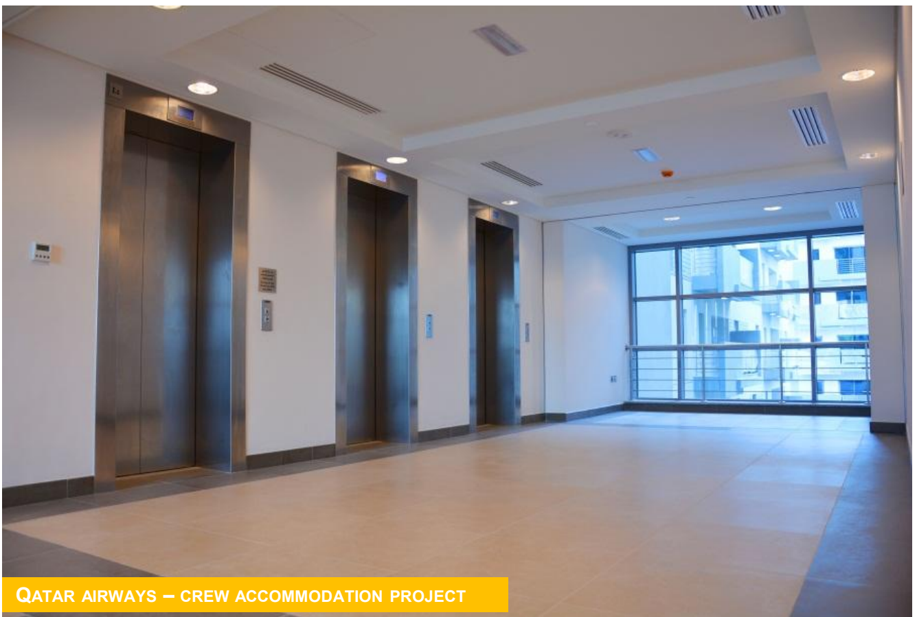
QATAR AIRWAYS – CREW ACCOMMODATION PROJECT