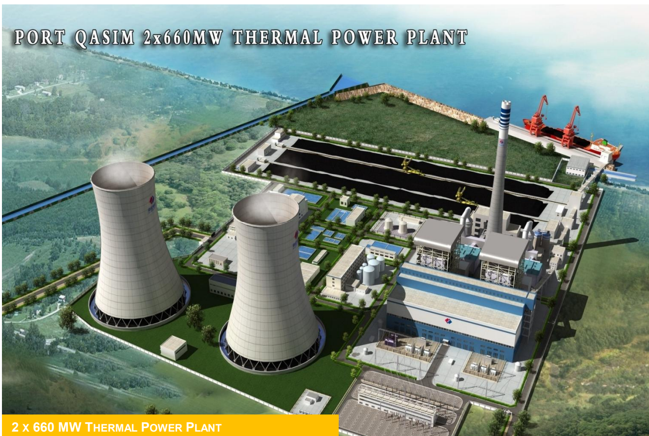
2 x 660 MW THERMAL POWER PLANT