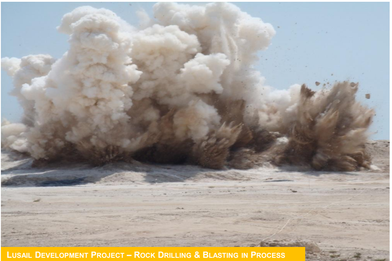
LUSAIL DEVELOPMENT PROJECT – ROCK DRILLING & BLASTING IN PROCESS