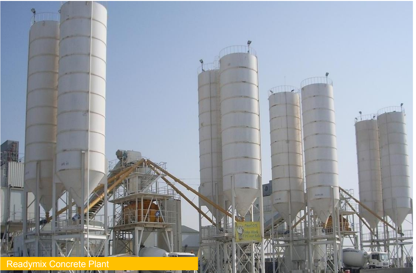
Readymix Concrete Plant