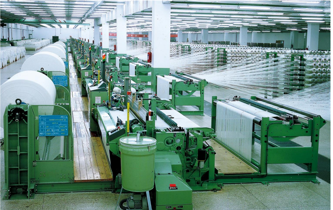
REDCO WEAVING & SPINNING MILLS