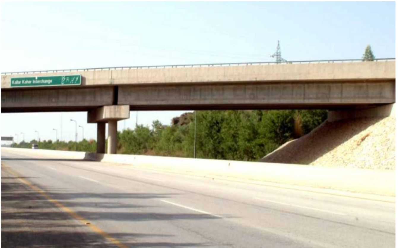
POST TENSIONED BRIDGE – MOTOR WAY PAKISTAN